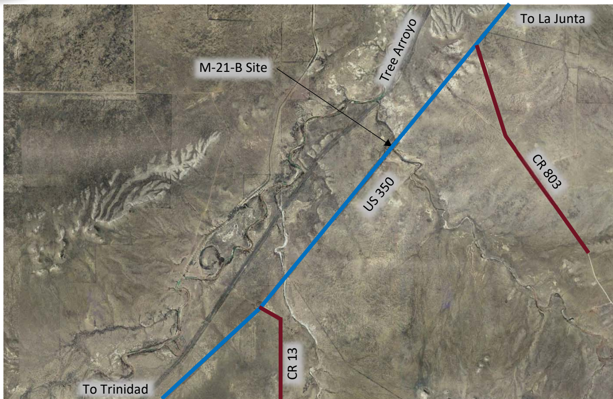
Figure 1: Vicinity Map